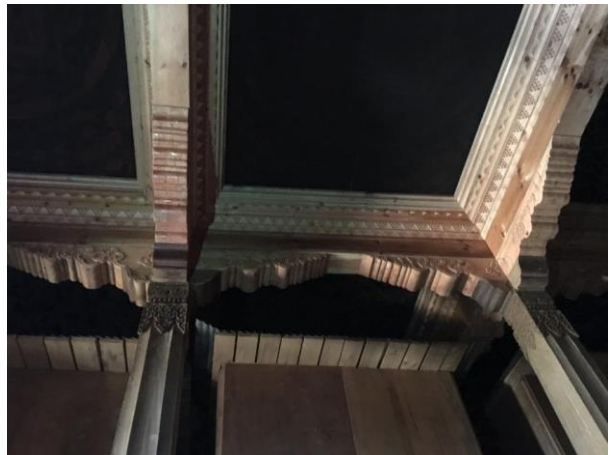
Fitting and Fixing of Namtha Gosum, Kachen and Dungs Completed