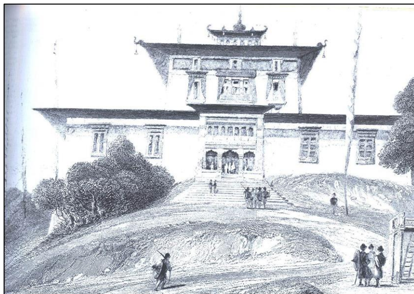
Sketch of Wangditse Dzong by Samuel Davis in 1783