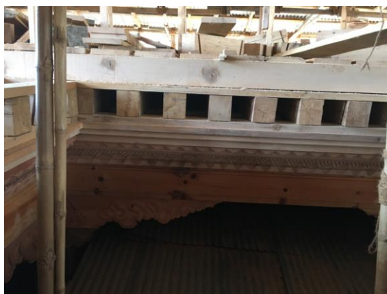
Fitting and fixing of battens, cham and planks for main lhakhang