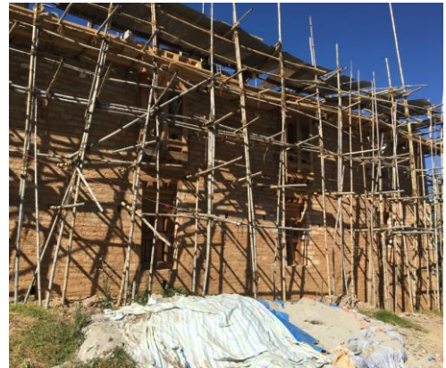
Construction of CRM Wall in mud mortar up to 1 st floor level completed