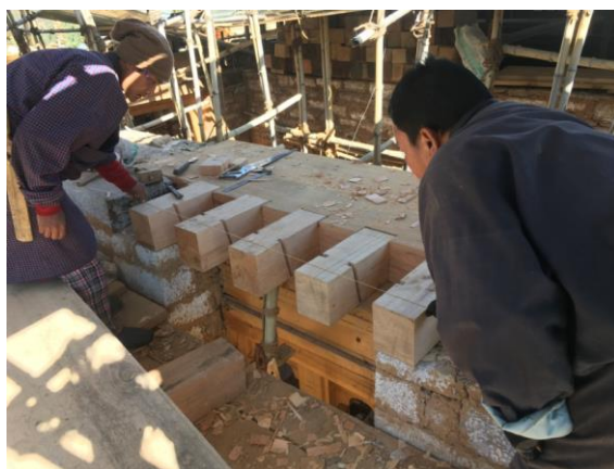
Fitting and fixing of timber component including Gayka, Window, Door & Rabsay completed up to 1 st floor level