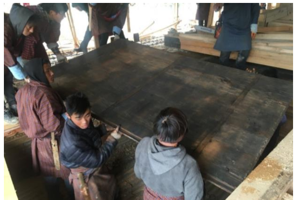
Fitting & Fixing of Kikhor Planks